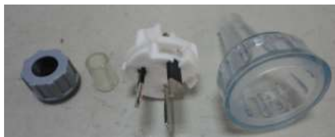
FIGURE 2: Pieces inside the package.

INSIDE THE PACKAGE: 1x piece of each - AU Certified 3-pin plug, Clear plastic protective cover, grey cord grip nut, plastic cover tube.