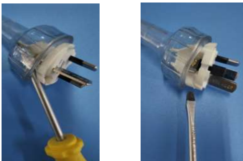
Figure 3: AU Plug Assembly / Disassembly: