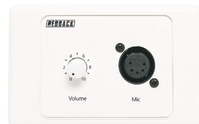
Fig 2. Redback® A 4953 Transmitter Wallplate

Failure to follow the correct wiring configuration may result in damage to system components.