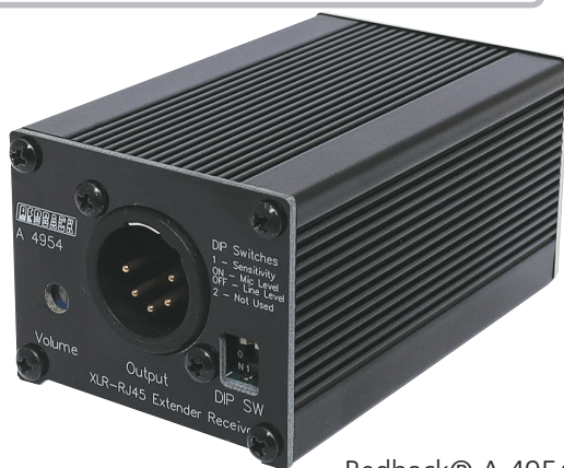
Redback® A 4954 (Front)