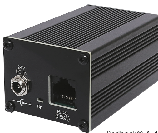
Redback® A 4954 (Rear)