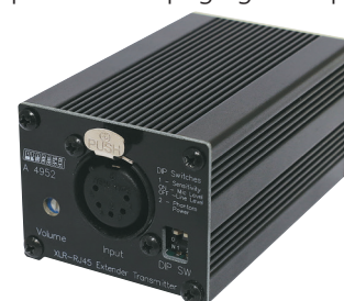
Fig 1. Redback® A 4952 Transmitter