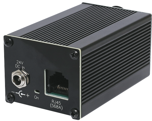
Redback® A 4952 (Rear)