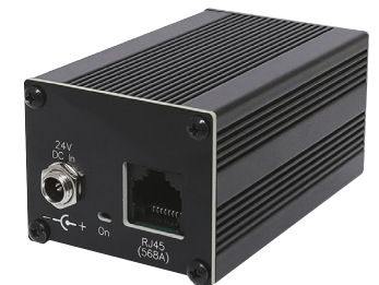
Fig 2. Redback® A 4954 Receiver (Rear)

Failure to follow the correct wiring configuration may result in damage to system components.