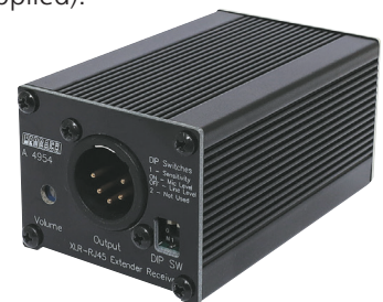
Fig 1. Redback® A 4954 Receiver (Front)

ON - Phantom Power Enabled (15V DC), OFF - Phantom Power Disabled.