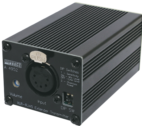
Redback® A 4952 (Front)