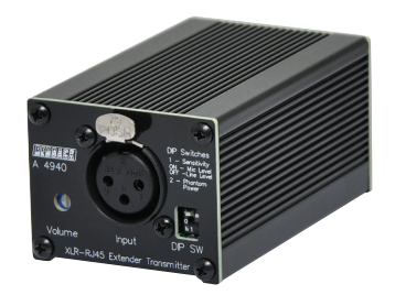
Fig 1. Redback® A 4940 Transmitter (Front)

The Redback® A 4946 can be connected to compatible Redback® products such as the A 4940 and A 4944. These products have either a 3 pin XLR (A 4940) or Dual RCA (A 4944) input and transmit this audio down the Cat5/6 connection to the Redback® 4946.