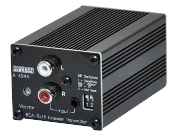
Fig 2. Redback® A 4944 Transmitter (Front)