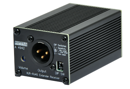
Fig 1. Redback® A 4942 Receiver (Front)