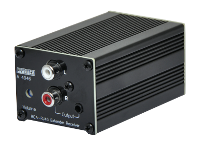
Fig 2. Redback® A 4946 Receiver (Front)

Failure to follow the correct wiring configuration may result in damage to system components.