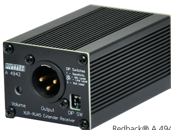
Redback® A 4942 (Front)