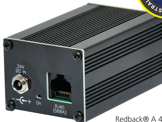
Redback® A 4942 (Rear)