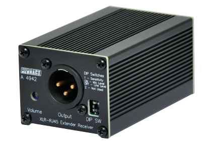
Fig 1. Redback® A 4942 Receiver (Front)

ON - Phantom Power Enabled (15V DC), OFF - Phantom Power Disabled.