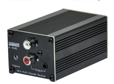
Fig 2. Redback® A 4946 Receiver (Front)

Failure to follow the correct wiring configuration may result in damage to system components.