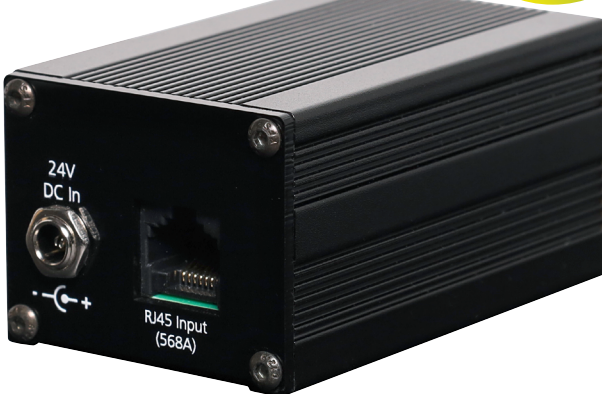
Redback® A 4658 (Front)