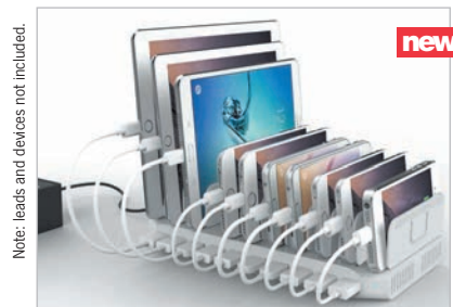
Note: leads and devices not included.