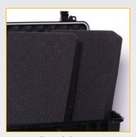
Dual layer foam inner.