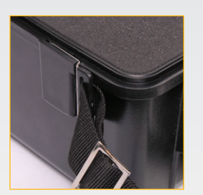
Integral carry strap recess.

The T 5065 Tuff Nut<sup>®</sup> features luggage style roller wheels and retractable trolley handle. Ideal for easy transportation with heavier equipment.