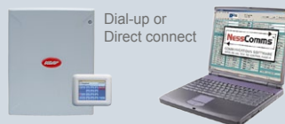
Optional programming by NessComms software*