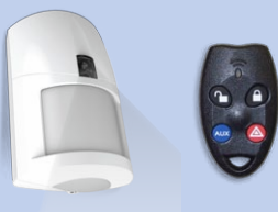
Wide range of optional Ness Radio Accessories