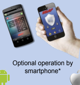
Optional operation by smartphone*