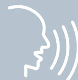
Voice alarms and voice prompts for remote telephone control