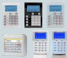
Wide choice of keypads