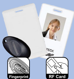
Onboard Access Control