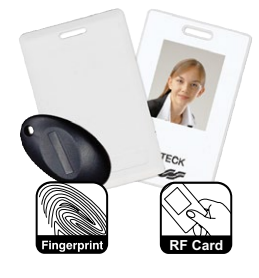
Onboard Access Control